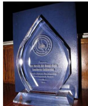
CAL 4 Wheel Drive, new member award