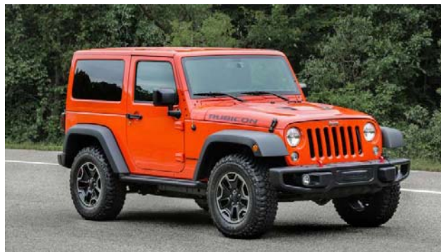
Romantic Rides for Valentine's Day