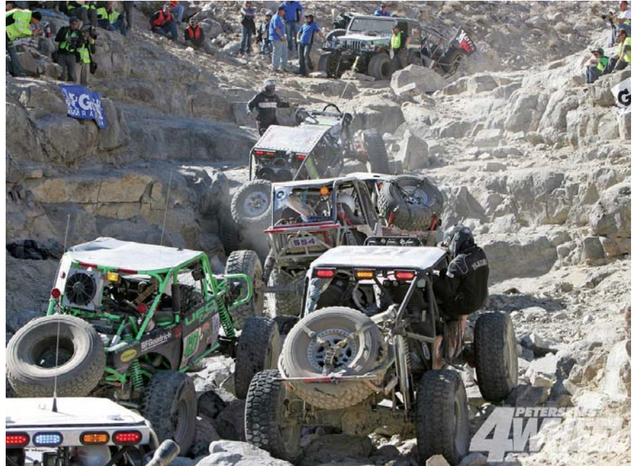
A view of Back Door Trail, only one out of ten rigs make it over the waterfall without winning. I am told that only 10% finish.

I and a few my former dirt bike riding buddies hung out at Brad's place in Johnson Valley, what a great location, after spending the days watching the race we were able to drive back up the hill, enjoy an adult beverage and dinner while looking over the whole valley. Yes, there is a cloud of dust that hangs over the whole valley. The dust cloud does not make it Brad's Place.